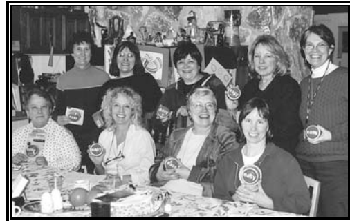
Alumnae Council Meeting March 2006