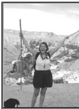
Havasupi Canyon Trip 2002