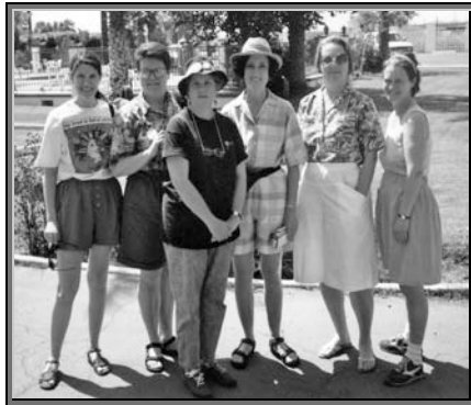
Alumnae Havasupi Canyon Trip 1992